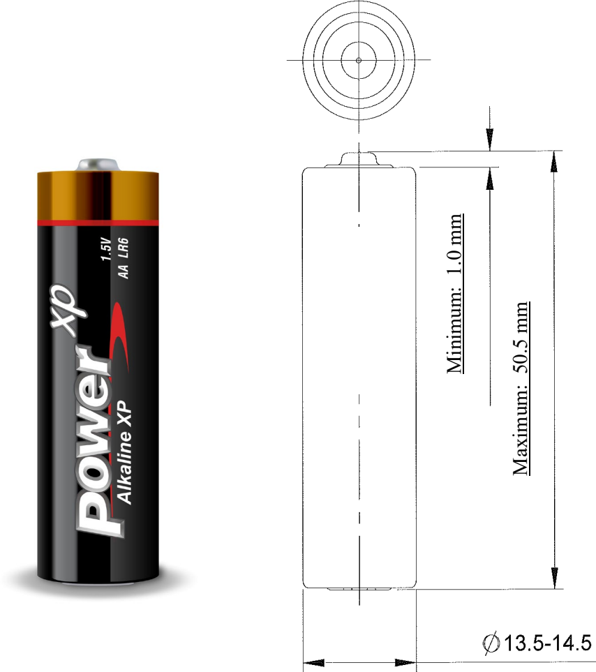
PH-AA-XP Battery Dimensions and Structure